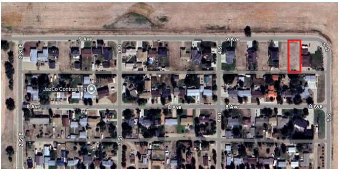
Town of Bassano Vacant Property Listing Details

BEAUTIFUL BASSANO - Welcome to an incredible opportunity to build your dream home in vibrant Bassano for only $5,000! This prime lot has all town services conveniently run to the property line, ready for your vision. Enjoy Bassano's charming community with an outdoor pool, local arena, parks, and a revitalized downtown. Buyers must submit a development permit application within 6 months of signing for a taxable improvement per LUB 921/21. There is also a build timeline requirement and minimum build size of 1400sqft with a front attached garage. Allowed property types include Prefab Homes and Stick Build. Mobile homes are NOT allowed. Call now to get more information as we have multiple lots available!